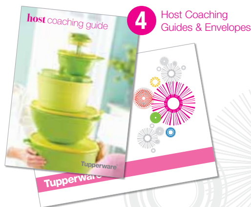
4 Host Coaching Guides & Envelopes